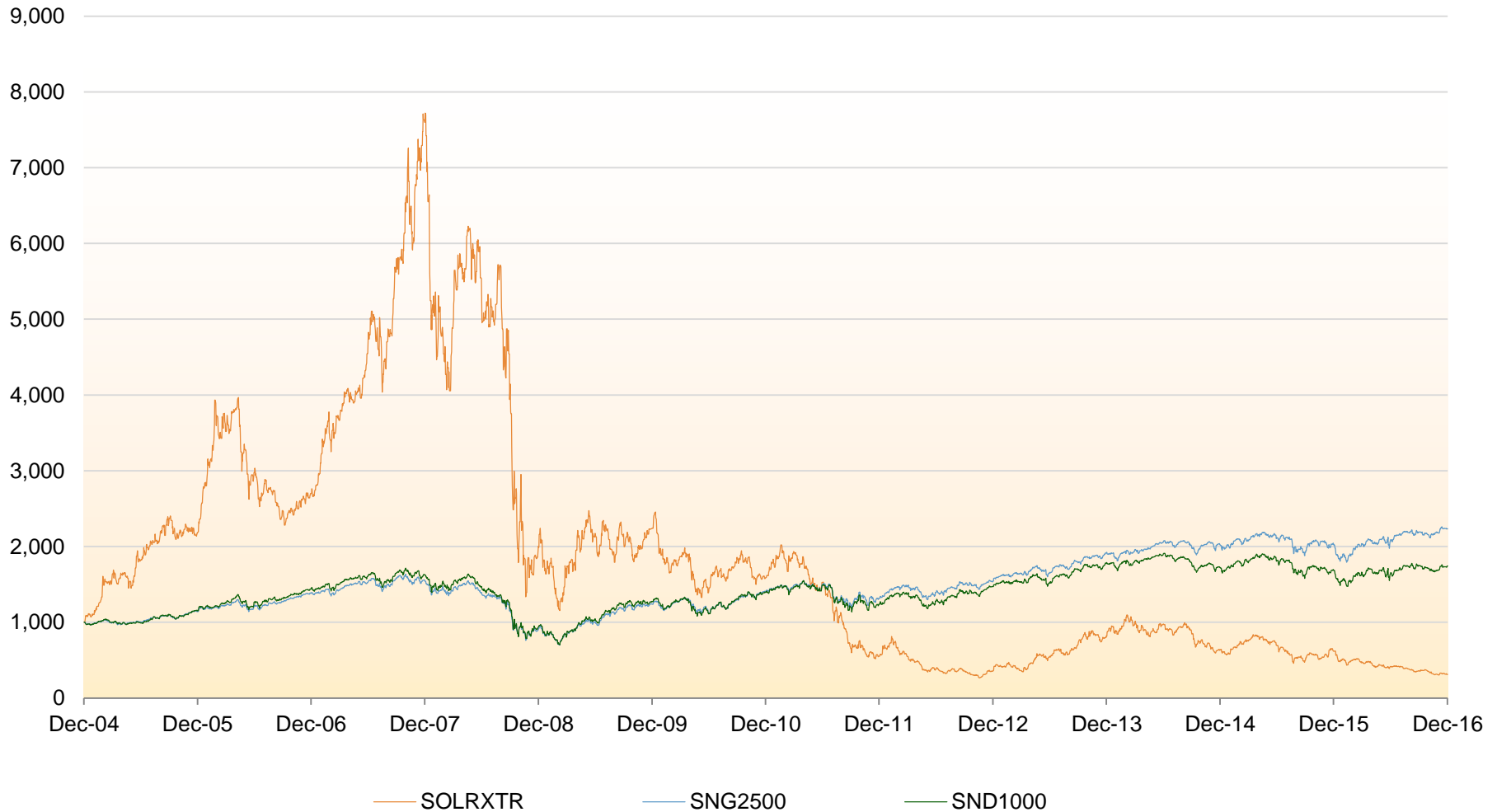
Ardour Global Solar Energy Index vs. Benchmarks (12/31/2004–12/31/2016)